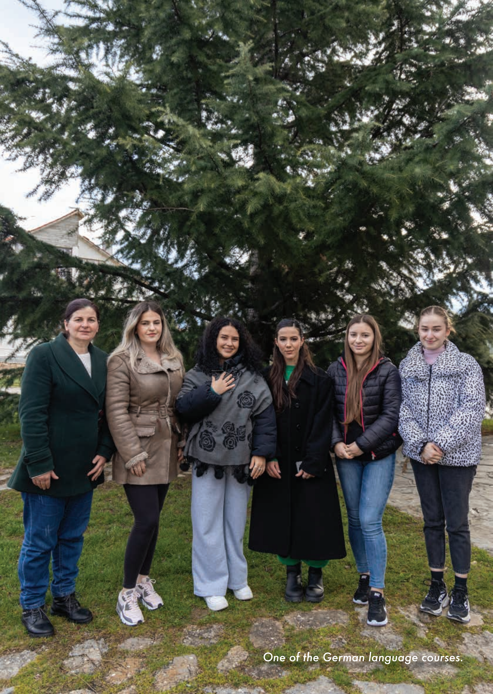
One of the German language courses.