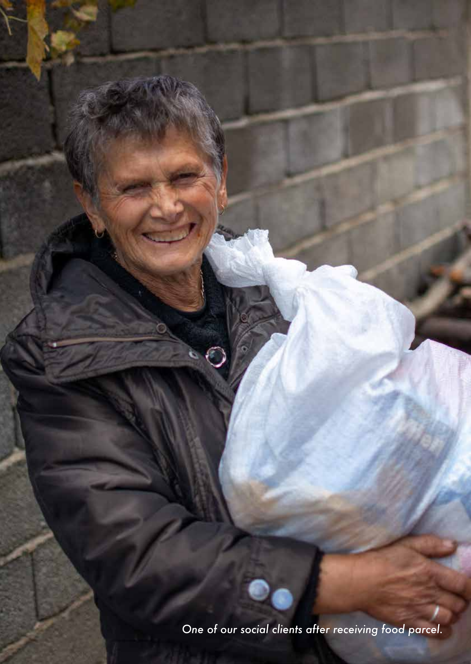
One of our social clients after receiving food parcel.