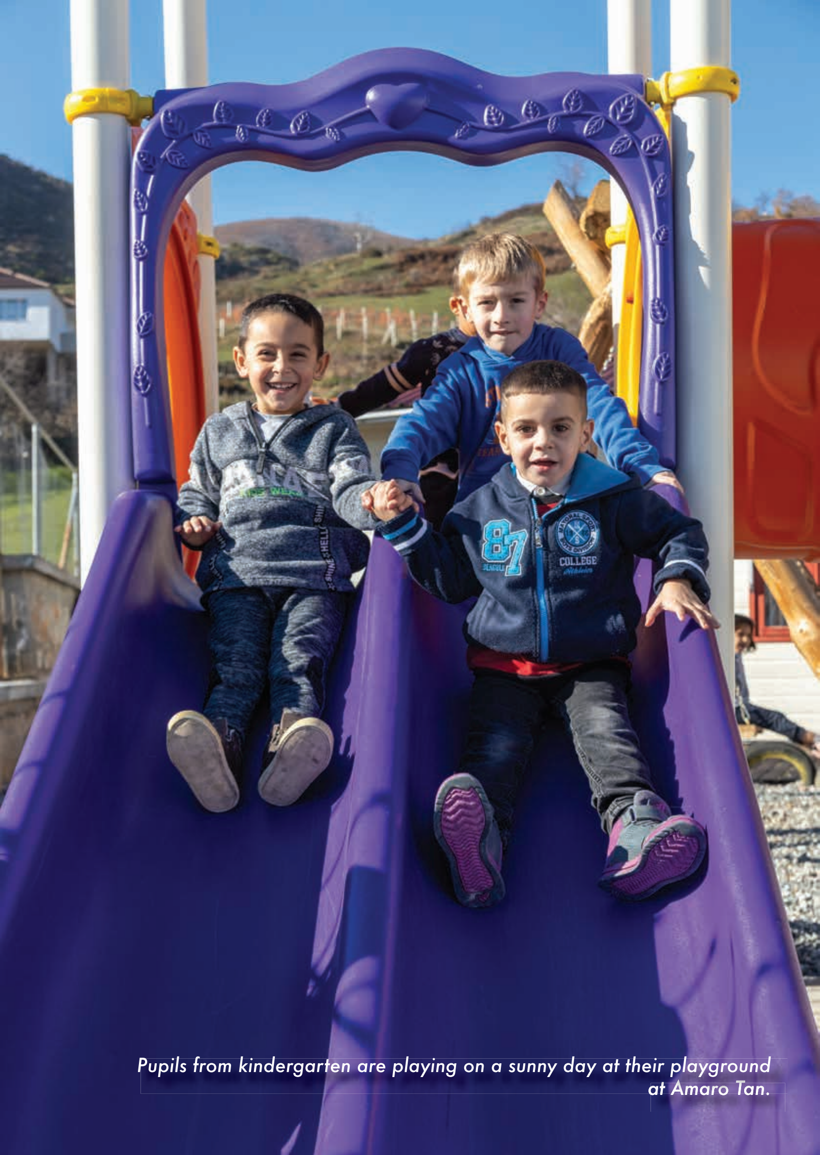
Pupils from kindergarten are playing on a sunny day at their playground at Amaro Tan.