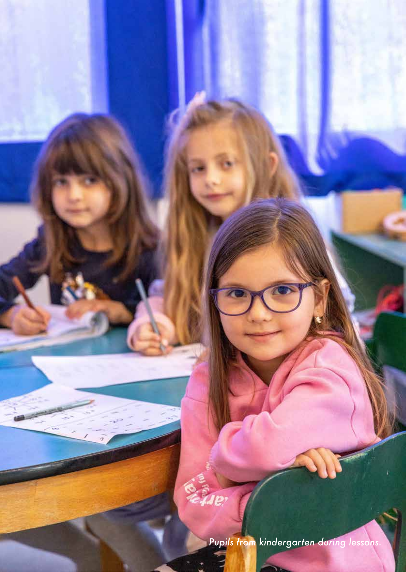
Pupils from kindergarten during lessons.